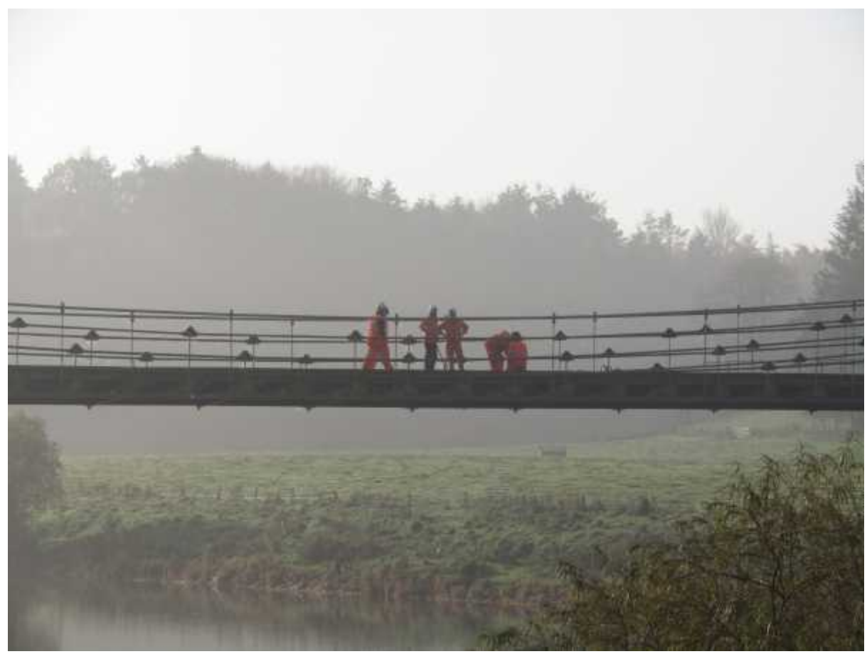
Above: Starting to remove the decking plywood to reveal the sleepers beneath; and, with the aid of an ecologist, to look for signs of bat habitation.